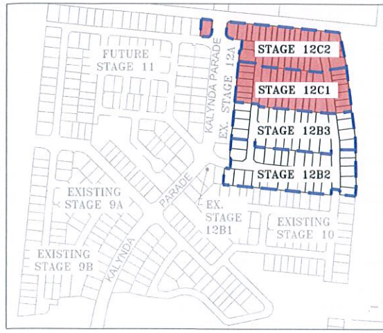
LOCALITY PLAN NOT TO SCALE