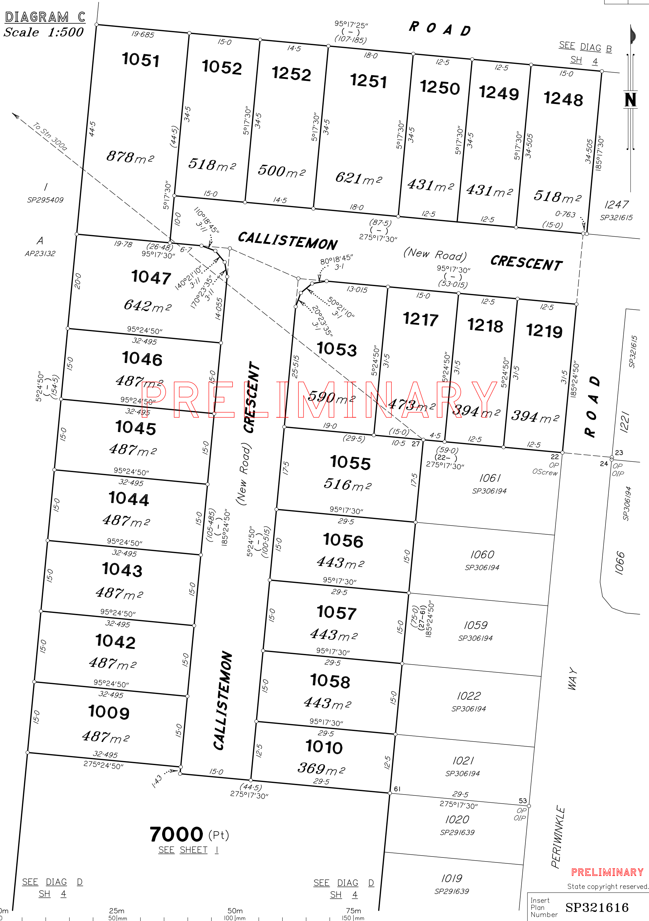
DIAGRAM C Scale 1:500