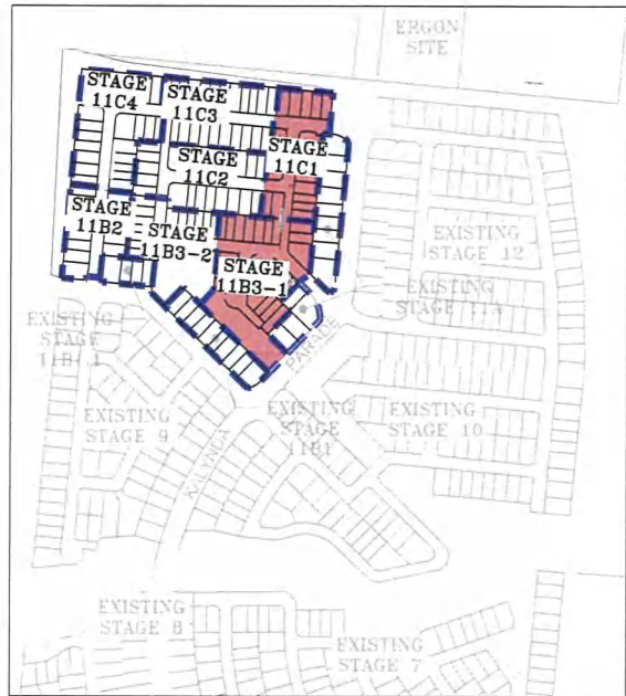
LOCALITY PLAN NOT TO SCALE

FOR CONTINUATION REFER DRAWING CT1521-CE102